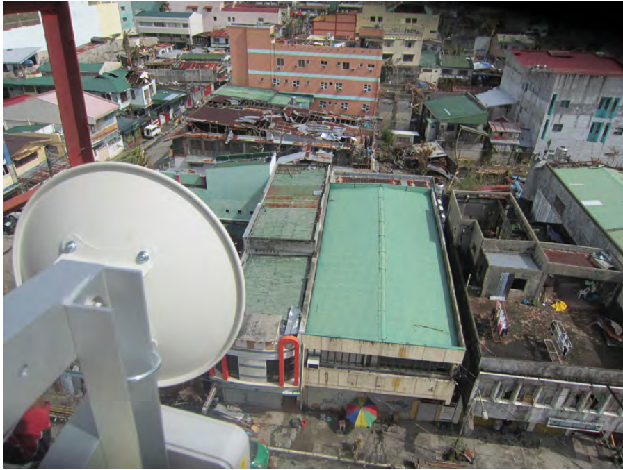
An Inveneo-installed wireless networking dish provides connectivity to a NetHope member NGO in Tacloban

Following our initial assessment in Haiyan-affected areas, Inveneo is prepared to offer the following services to NetHope member organizations: